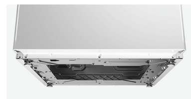
EASY-ACCESS STEEL BASE