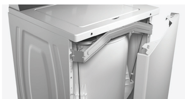
REMOVABLE FRONT PANEL