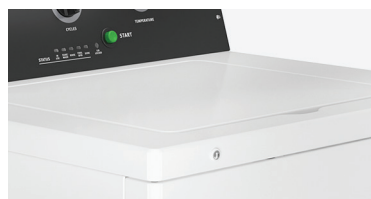
PREMIUM PORCELAIN ENAMEL TOP & LID